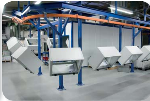
Powder coating line