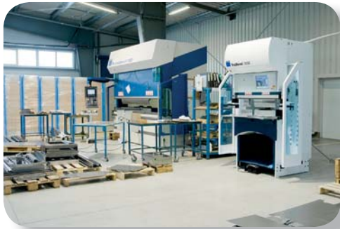
Bending workplace TRUMPF-TRUBEND