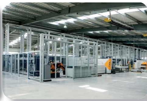
Bending center RAS