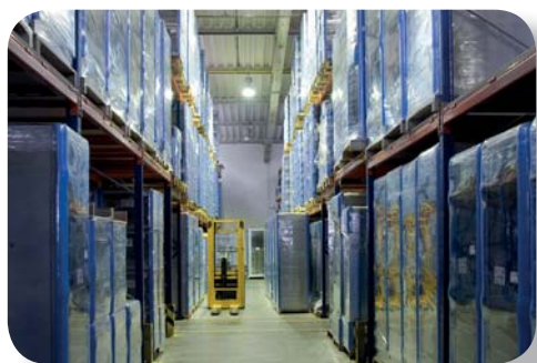
A new expedition hall