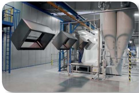
Powder coating line